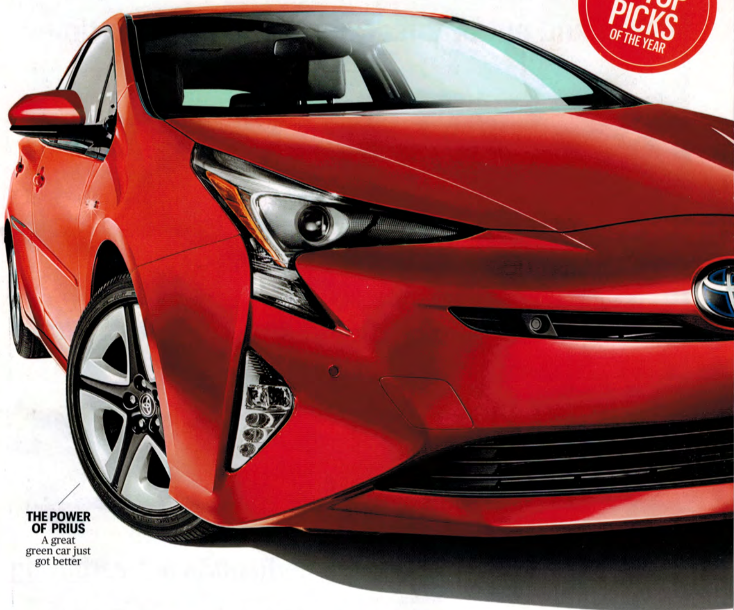
THE POWER OF PRIUS A great green car just got better